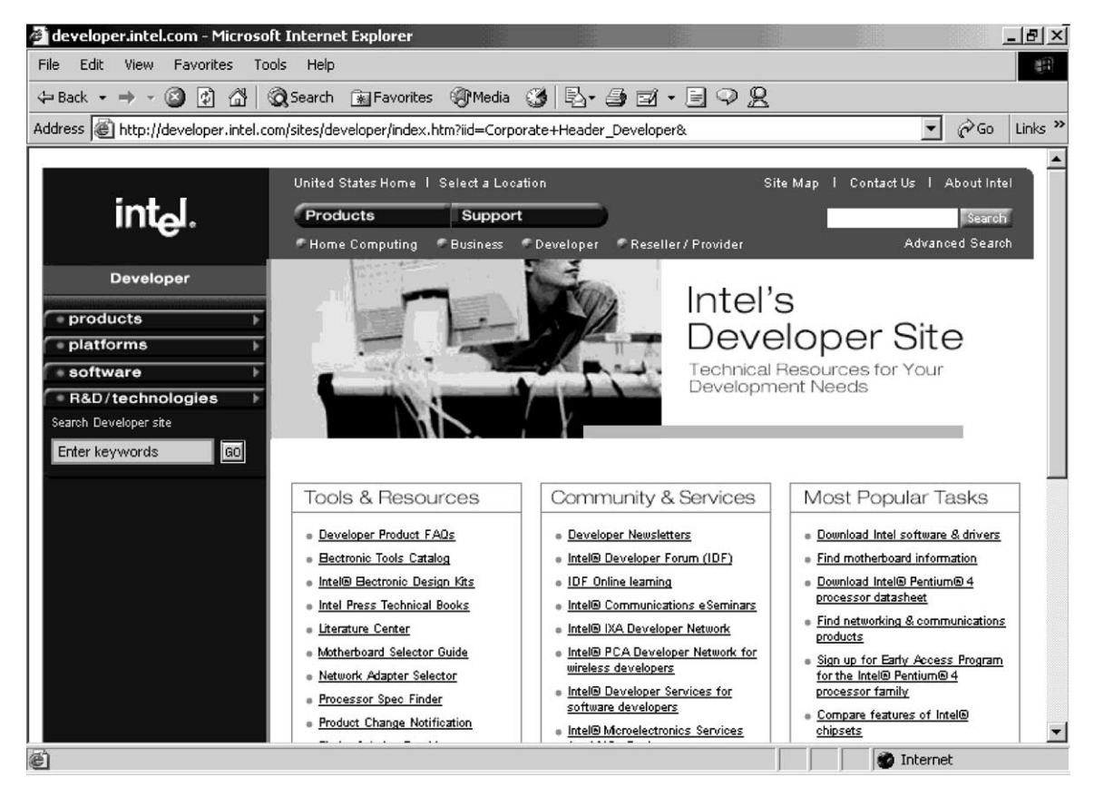
Fig. 2. Intel's developer site.