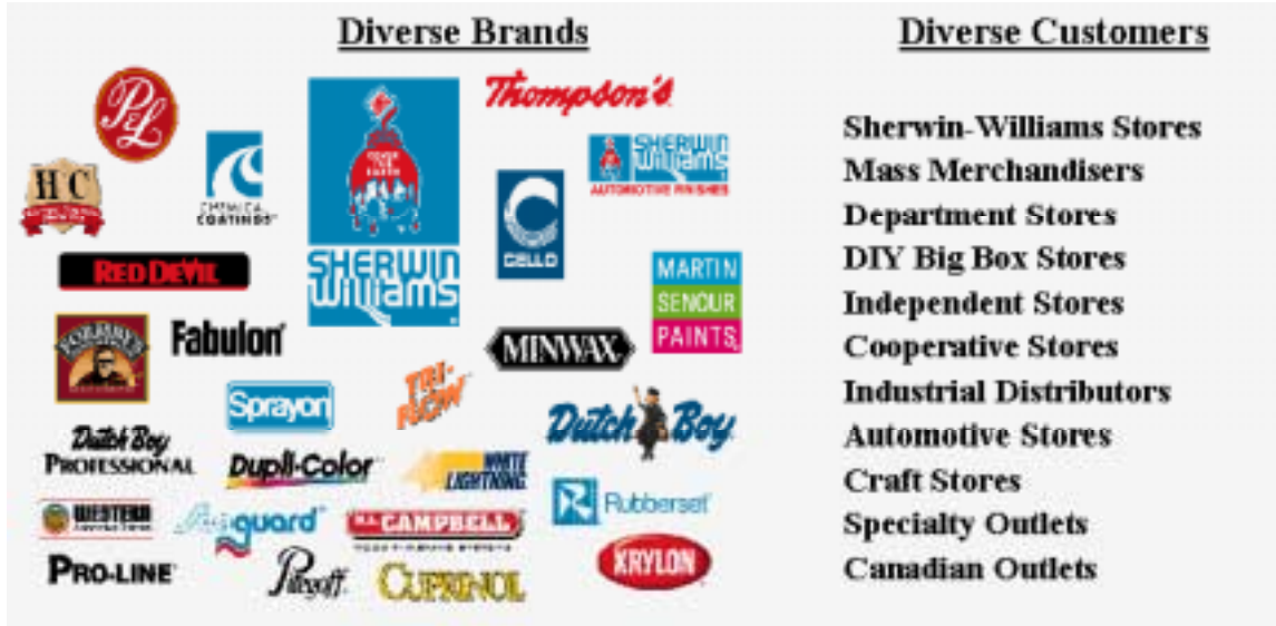
Figure 1: Sherwin-Williams Brands and Customers