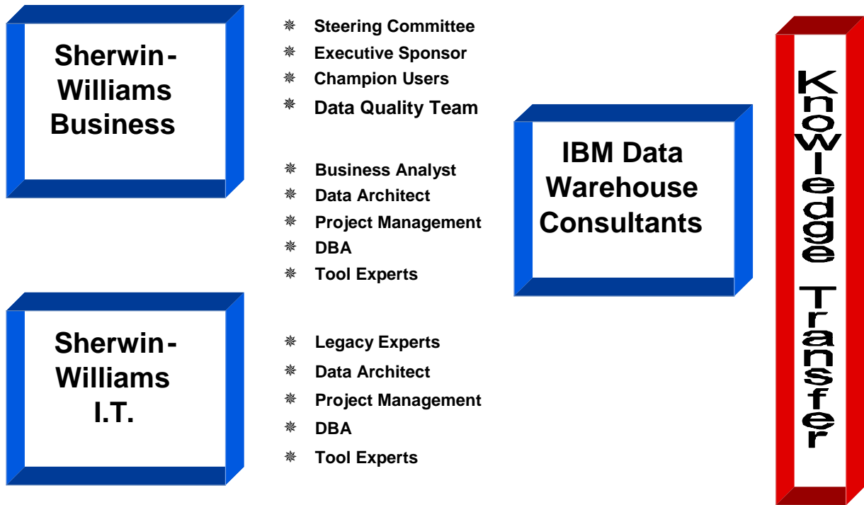
Figure 4: Data Warehouse Project Team

gained a large amount of knowledge about Sherwin Williams' business processes.